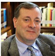
The Rev. Dr. Alister McGrath

Conference sessions will be held at the Charleston Music Hall, with accommodations next door at the Hampton Inn, in the heart of Charleston’s famed Historic District. The conference registration fee of $250 includes all sessions and materials and services; but meals and accommodations are on your own. Registration will open October 4 at mereanglicanism.org . Please register early, as the past few Mere Anglicanism conferences have sold out well in advance. For more information, please contact us at info@mereanglicanism.org .