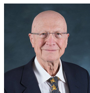
Dr. Peter Kreeft